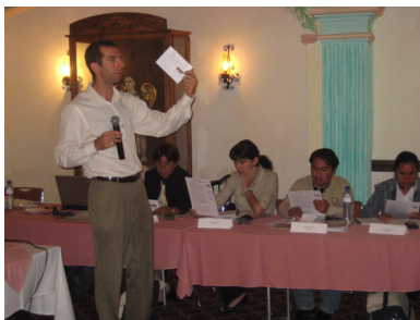
Live PLN, Latin American Forum

Meeting participants concluded that the group would profit from regular interaction to channel the learning and the momentum. They have since begun an e-mail exchange, sharing issues, ideas and data.